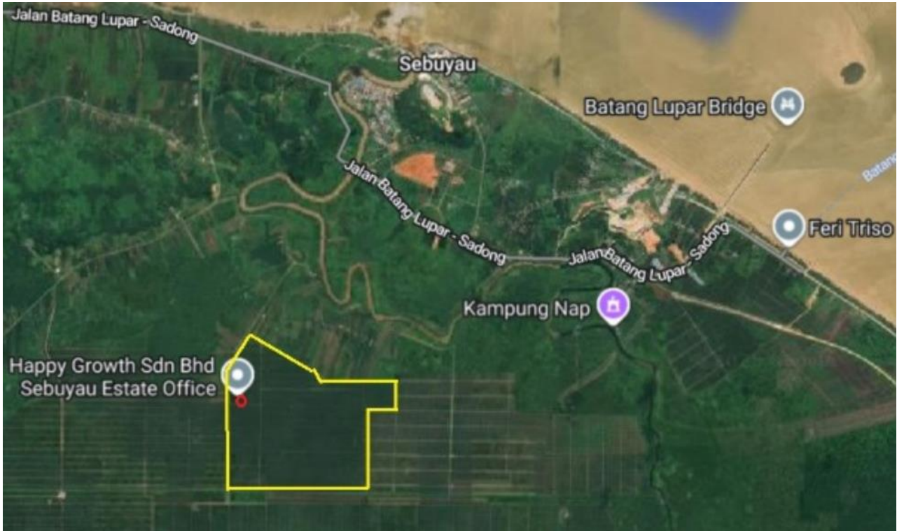
Close – up of village site

Geological Location: 1.479877 N 110.909644 E