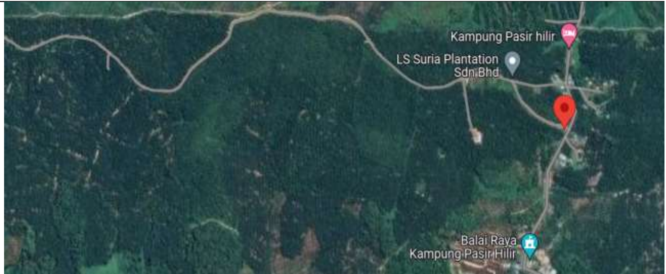
Google Location Map [Aktif Muhibbah Sdn Bhd] (Geo-coordinate: N1.607240, E109.793230)