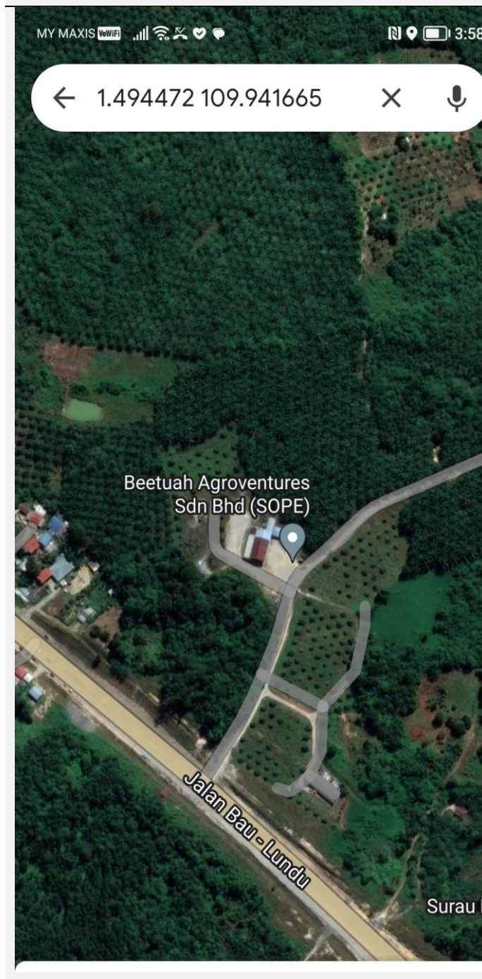
Google Location Map [Estate Location]